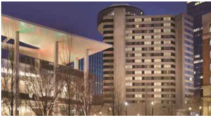
Hyatt Downtown 320 W Jefferson St, Louisville, KY 40202