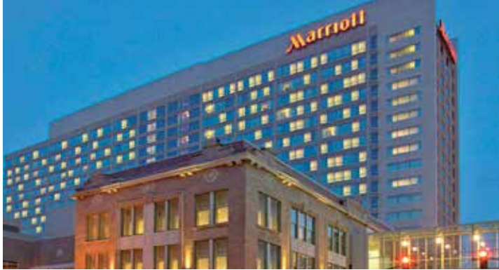
Marriott Downtown 280 W Jefferson St, Louisville, KY 40202