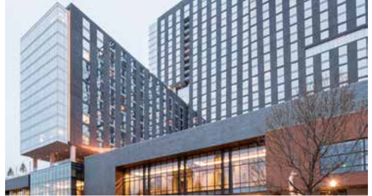
The Omni 400 S 2nd St, Louisville, KY 40202