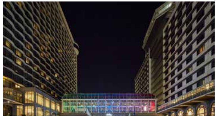
The Galt House 140 N Fourth St, Louisville, KY 40202