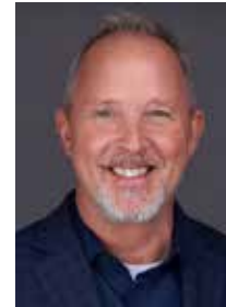
Paul Rieger Modern Railway Systems