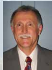
Phil Hess Rails Company